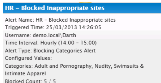
Figure 1 - User who generated Alert based on visiting inappropriate websites

The Alerts show current situations which might require attention or investigation based on configurable parameters defined under Settings > Alerts . These will allow you to monitor anomalous situations such as users visiting Inappropriate sites, or specific users downloading large volumes of data.