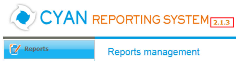
Figure A.2. Version information of the Reporting System